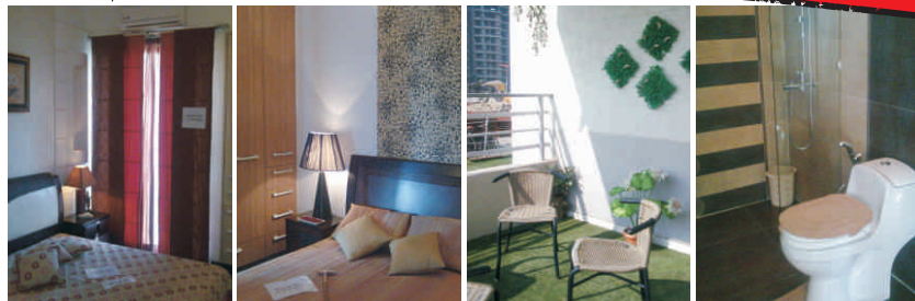
Actual Sample Flat Photo